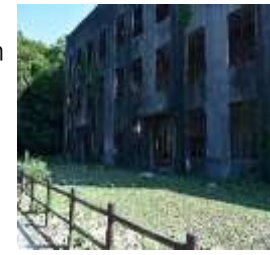
a power plant

This is the site of a power plant and a storehouse of poisonous gas. They were used by the military of Japan from 1929 to 1945. Along the cycling and walking course, you can visit a site of a fort and a museum of poisonous gas. The remains can help you understand the history of this island.