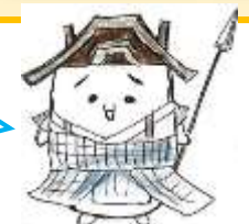
Mishima-kun, a character of Omishima Branch School