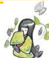
Imoko-san, a character of Omishima Branch School