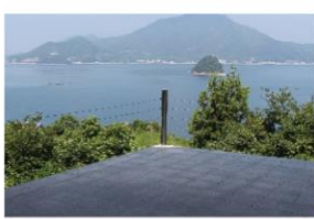
View from the "Terrace"

It commands a fine view of the sea and trees. The landscape looks different each season.